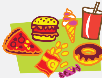
Sweets, food, drinks, sugars